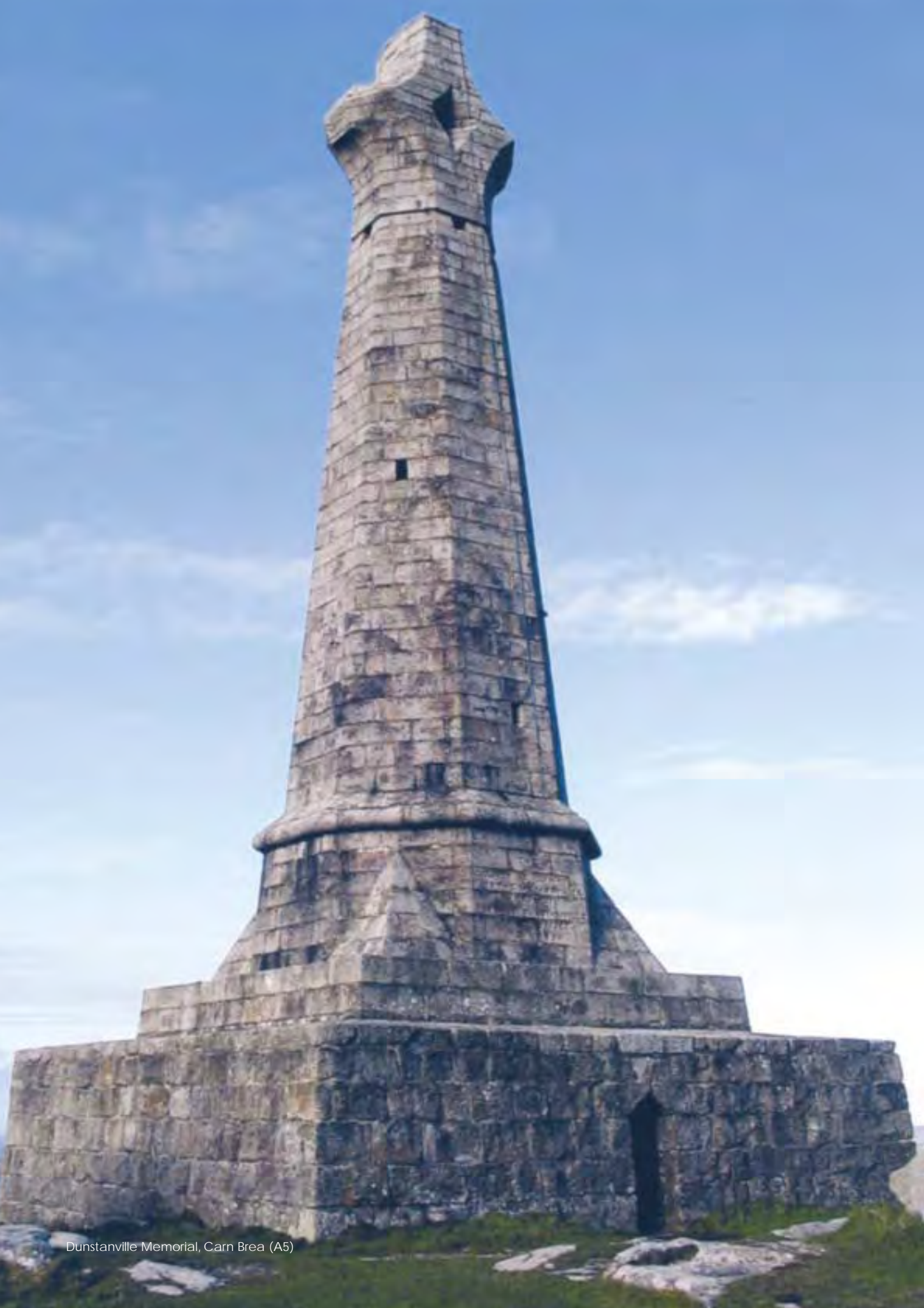
Dunstanville Memorial, Carn Brea (A5)